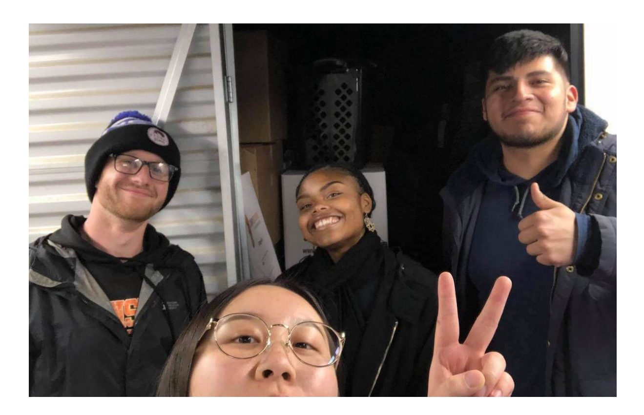
COVID: One Year Later

solutions to help solve community problems in the midst of a pandemic. So many stories have been collected of Philly citizens making a positive impact through these tough times and beyond! Read on to learn about how different initiatives (including CSN) rose to the challenge and made amazing differences in the City of Brotherly Love!